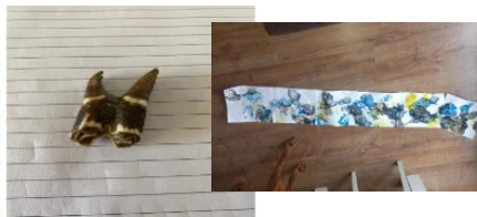
a fossil of a bison tooth I found at the beech